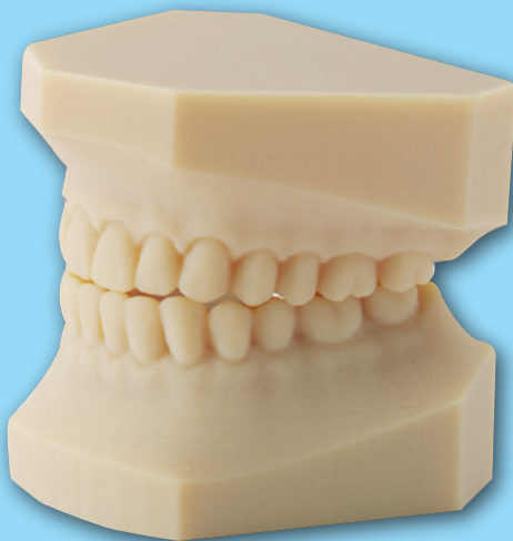
Actual mold printed from our 3D Printer

Give us a call today and let us show you how 3D printing will revolutionize your practice.